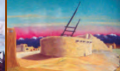
Tax & Revenue