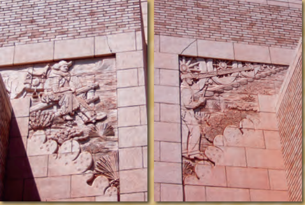
Quay County Courthouse, Tucumcari - Exterior Bas Reliefs