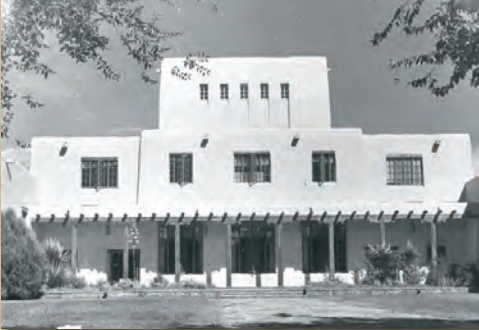
Zimmerman Library - University Of New Mexico WPA