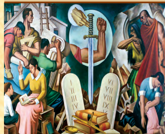
Justice Tempered with Mercy by Emil Bisttram Old U.S. Federal Court House, Albuquerque