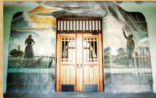
"Sun and Rain" by Peter Hurd - County Building, Alamogordo (formerly the U.S. Forest Service Building)