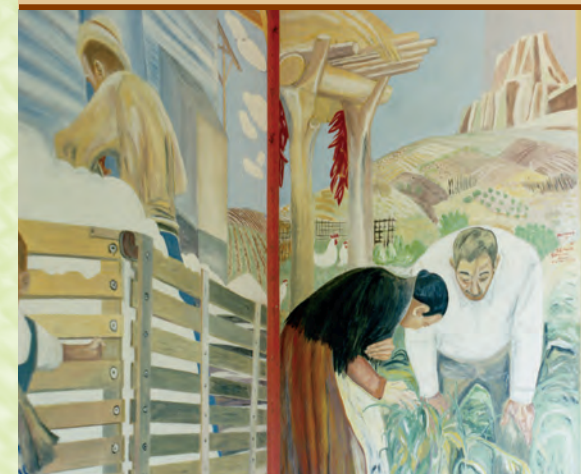
WPA mural by Olive Rush - NMSU, Las Cruces