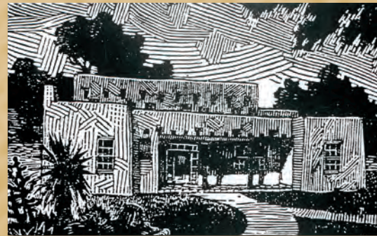
Manville Chapman - Roswell Museum/Art Center