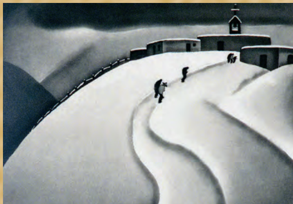
"Winter Mass" by Gene Kloss is one of the nine etchings that she made for the Federal Art Project and they were reproduced and distributed to many schools and institutions all over the state. Some are still in place like at the National Park Service's Old Santa Fe Trail Building in Santa Fe while others have disappeared. Help us find the missing ones.