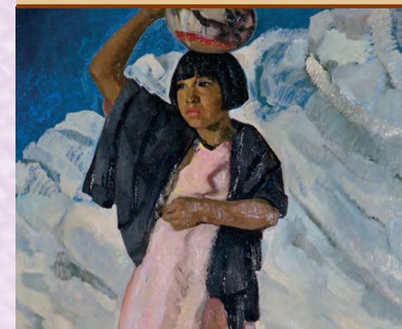
Westwind - Pueblo Maiden by Joseph Fleck Octavia Fellin Library, Gallup