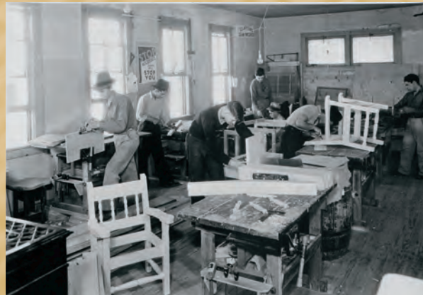
Clayton craftsman were not limited in items they made for the town's schools. Many are still in use in the schools today and also in their WPA Museum.